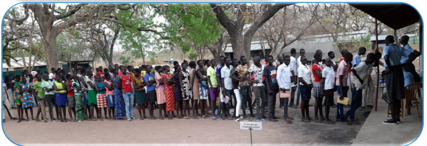
Student Leaders help to organize entrance interviews.