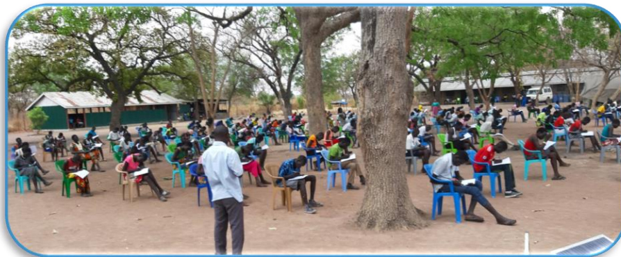
Exams and interviews for the 2019 school entrance applicants. The need and demand for secondary education is great.

To equip students for leadership through education takes many types of lessons. Our students are engaged in a rigorous high school academic program that includes a full curriculum in subjects such as math, sciences, English composition, history, geography, agriculture, business, and religious studies. They are also taught by hands-on experiences and mentoring. It is our experience that students become leaders by leading, so it is the culture of the school that students participate in the day-to-day running of the school. Student leaders are elected and serve to direct the student body by delegating duties, overseeing programs, and serve as good role models. It is a motivational time in the life of a student and mentoring them into future leaders.